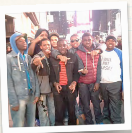
NYCTRIPTO 106 & PARK